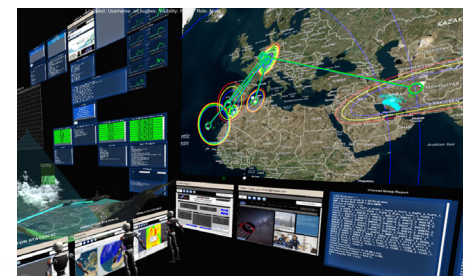
Virtual Operations Center