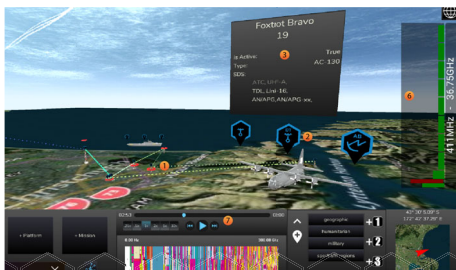
Spectrum Visualization Tool

3DataLinQ is wrapped in its own secured virtual machine and provides the ability to cost-effectively integrate existing tools, databases, and analytics to experiment, visualize, assess, and rapidly reconfigure solutions to complex problems.